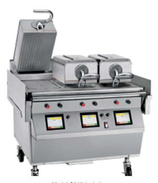
Model G810 Includes grooved upper platen.